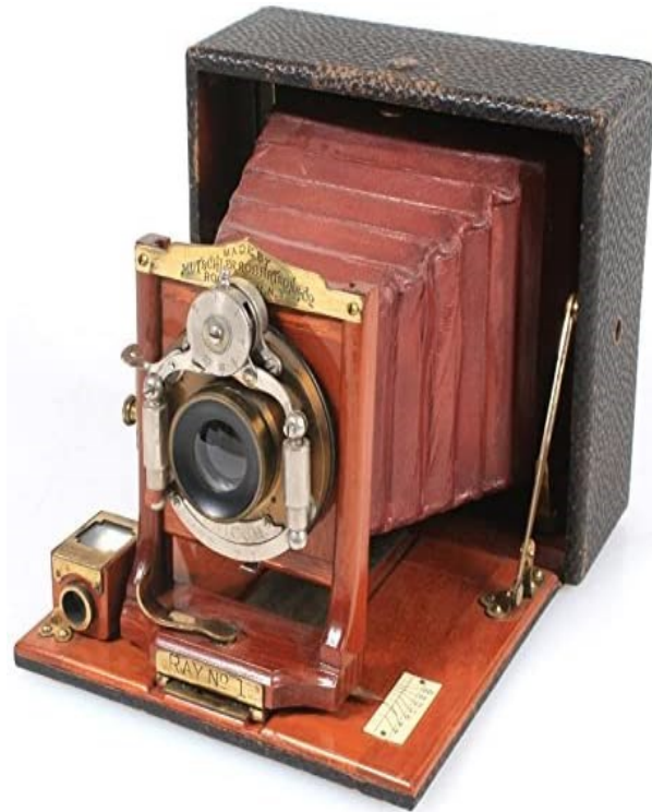
Cyanotype Box Camera