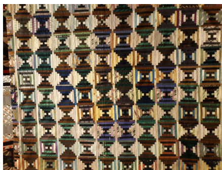
The Court House Quilt