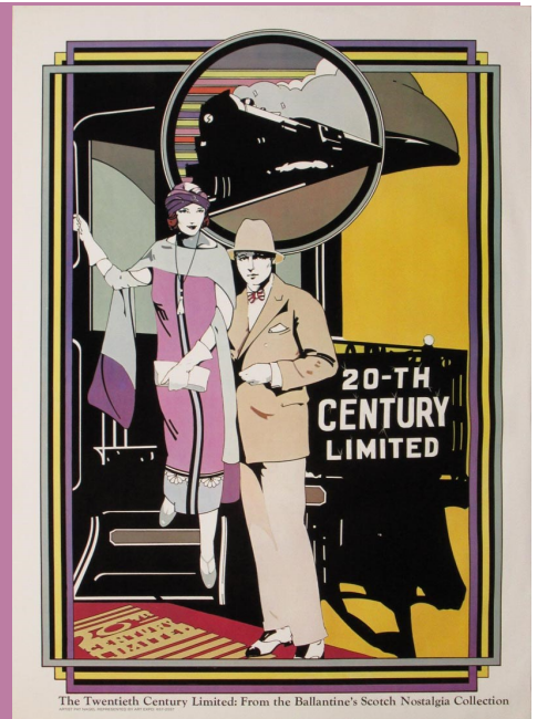
The Twentieth Century Limited: From the Ballantine's Scotch Nostalgia Collection